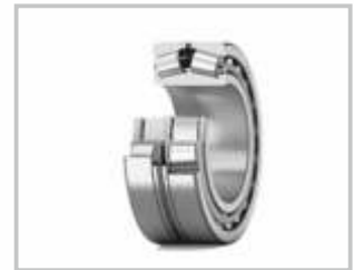
Double Row Taper Roller Bearing