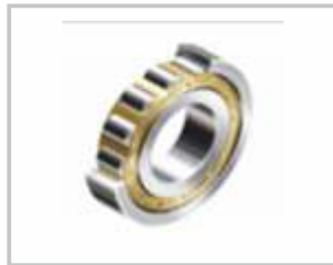
Cylindrical Roller Bearing