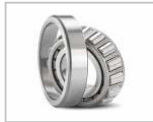
Taper Roller Bearing