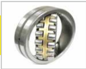
Spherical Roller Bearing