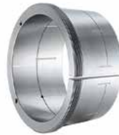
Hydraulic Withdrawal Sleeve