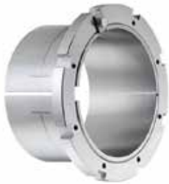
Hydraulic Adapter Sleeve

Using hydraulic versions, installing and removing bearings on adapter or withdrawal sleeves can be significantly eased. They have oil grooves in the tapered outside surface and holes for the oil injection.