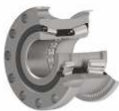
UNITISED TAPERED ROLLER BEARINGS 2