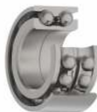
DOUBLE ROW ANGULAR CONTACT GEN 1