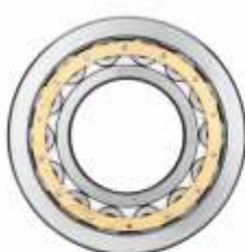
CYLINDRICAL ROLLER BEARINGS