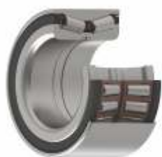
UNITISED TAPERED ROLLER BEARINGS