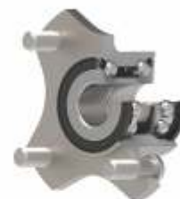
GEN 2 WHEEL HUB BEARINGS