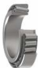
TAPERED ROLLER BEARINGS