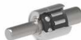
WATER PUMP BEARINGS