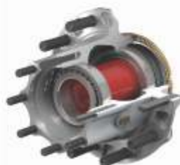
PRE-SET HUB BEARINGS