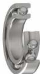
Open Type DGBB