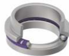
Oil impregnated ball/ cage assembly