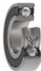
Sealed Type DGBB (Single and Double Side)