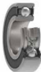
LT-type Sealed DGBB