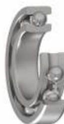
Deep Groove Ball Bearings