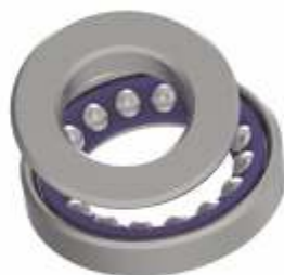
Thrust Ball Bearing