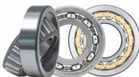
POWER DENSE - Special heat treatment, Integrated solutions