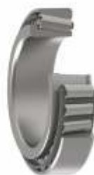
Taper Roller Bearing Set