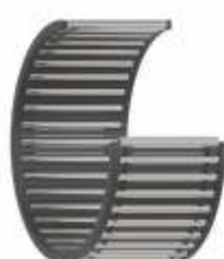
NEEDLE ROLLER BEARINGS