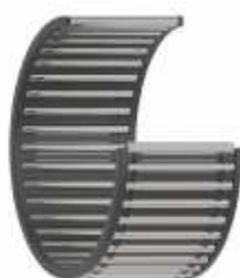
Needle Roller Bearing