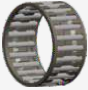
Needle roller and cage assembly