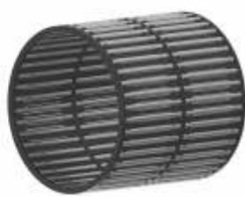
NEEDLE ROLLER BEARINGS