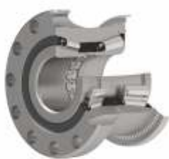
UNITISED TAPERED ROLLER BEARINGS 2