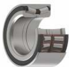
UNITISED TAPERED ROLLER BEARINGS