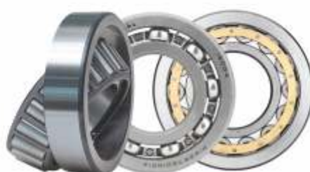
POWER DENSE - Special heat treatment, Integrated solutions