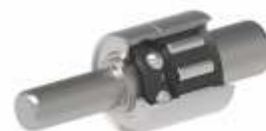
WATER PUMP BEARINGS