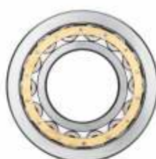
CYLINDRICAL ROLLER BEARINGS