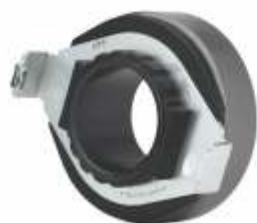
CLUTCH RELEASE BEARINGS