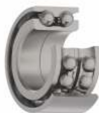
DOUBLE ROW ANGULAR CONTACT GEN 1