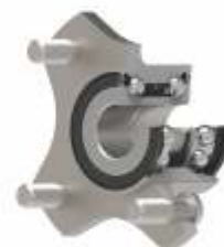
DOUBLE ROW ANGULAR CONTACT- GEN 3