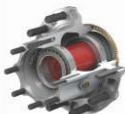
PRE-SET HUB BEARINGS